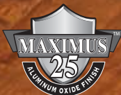
Photo features Deer Lodge Hand Scraped - Birch - Almond