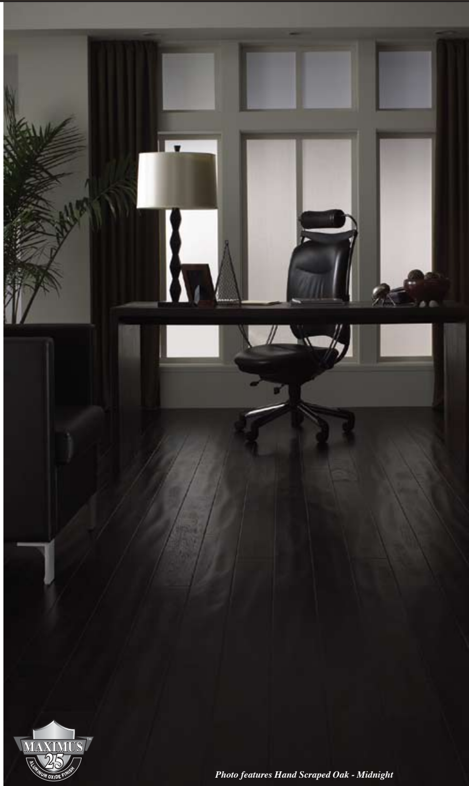
Photo features Hand Scraped Oak - Midnight